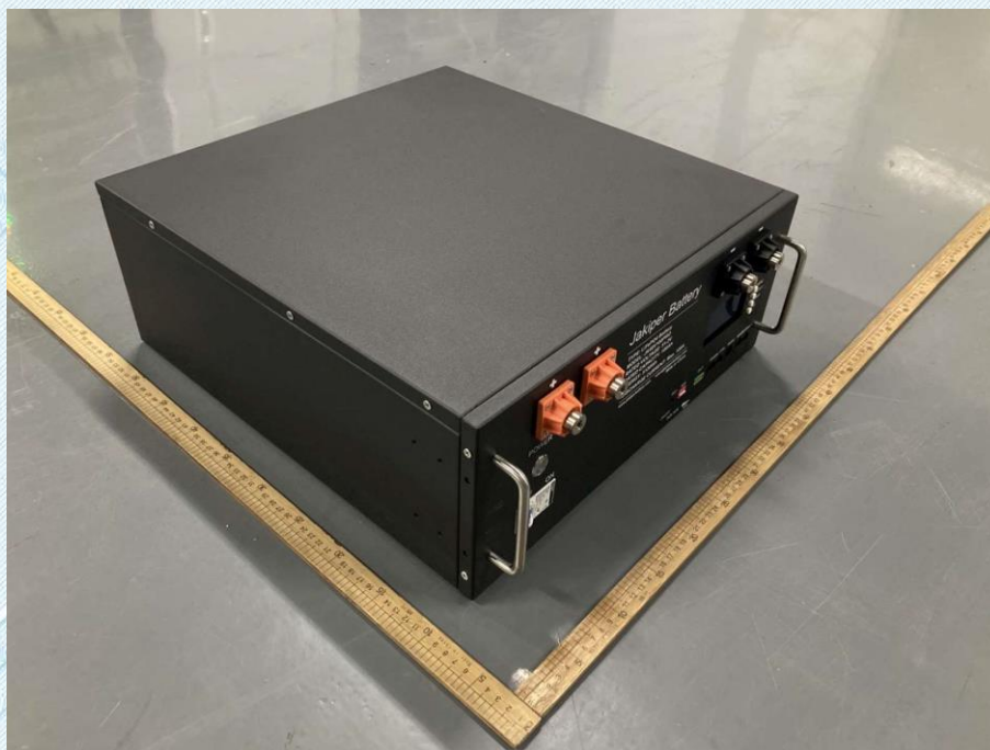
Figure 1 Front view of battery