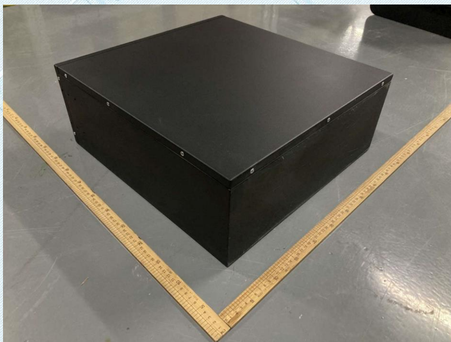
Figure 2 Back view of battery